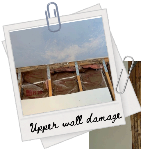
Upper wall damage

We're also excited about the momentum on the remediation of the termite damage in the Gift Shop/Welcome Center. As you know, it took some time to acquire quotes from qualified commercial contractors. We are so thankful to be partnering once again with long-time local professionals R.K. Davis Construction to oversee this project. On June 10th & 11th an exploratory surgery, of sorts, was undertaken to verify the extent of the termite damage behind the walls. We shouldn't have been shocked, but we were, at just how destructive these pests are. The process to bring this to completion is not a quick venture and I personally am learning patience. The next steps are City approvals, permitting, and then actual construction. We're not anticipating any hiccups and hope the construction will start in late August. The timing of the entire project will get us completed and restocked by the start of the 10th Annual Garden of Lights. During construction, we'll be moving the Gift Shop to the main floor of Heathcote House. We believe this will be an added treat for those interested in seeing this building firsthand and will keep a loss of revenue to a minimum.