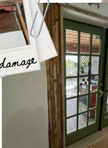
Interior wall damage